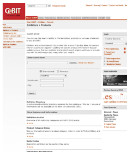
Use the handy CeBIT exhibitor and product website to plan your "route" at the event.

→ Are you interested in planning your visit in advance to save valuable time at the event? The CeBIT portal, maintained 24/7 by Hannover-based Deutsche Messe, will help you do just that. As of the end of January 2010 you'll find detailed information on the exhibiting companies and their products and services at www.cebit.de/exhibitorsproducts . In addition, hall maps and lists of exhibitors are available to ensure you won't miss any of the relevant offerings. The website is regularly updated, guaranteeing fast and effective exhibitor and product searches.