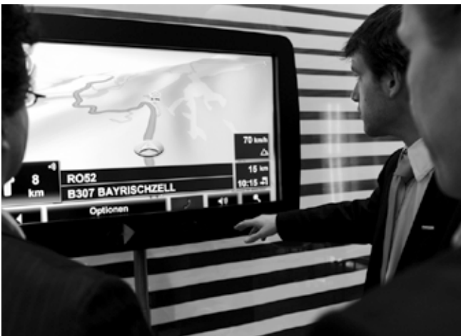
Navigation aid: the "CeBIT in Motion" forum features specialist presentations and information on all aspects of telematics and navigation.

→ Following a protracted boom phase, the market for navigation devices and solutions is now under heavy pressure due to falling profit margins and "freebies". For this reason, the focus will be on solutions, strategies and business models at the "CeBIT in Motion" forum, once again forming a major part of the "Destination ITS" special display in 2010. This part of the show features Telematics and Navigation, Automotive Solutions and Transport & Logistics providers. The forum is located on the gallery in the eastern section of Hall 7, directly above exhibitor stands.