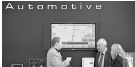
Magnet for automotive specialists: the Navigation Day symposium on 5 March.

Apart from presentations, the forum also features panel discussions and user-focused discussions. Further information is available at www.cebit.de/inmotion_e .