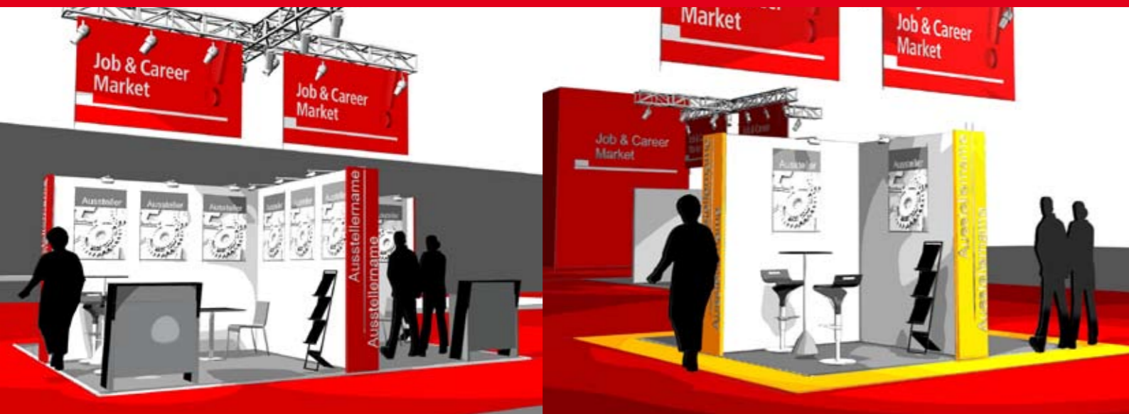
„Advanced Package Example“