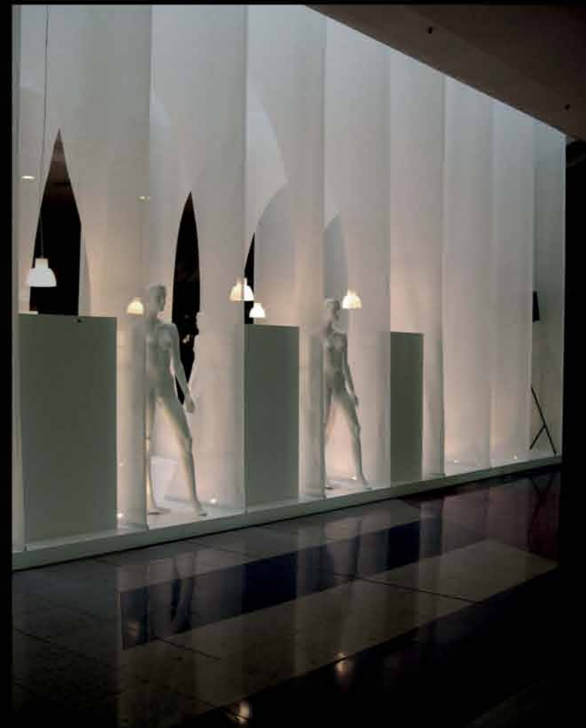
travelling showroom for four Portuguese fashion designers