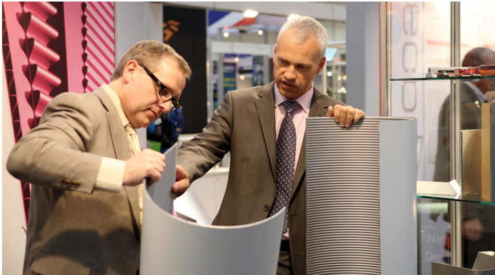
Lightweight solutions: strong international interest in materials and energy efficiency potential.

Advanced hi-tech materials tackle the challenge of materials and energy efficiency