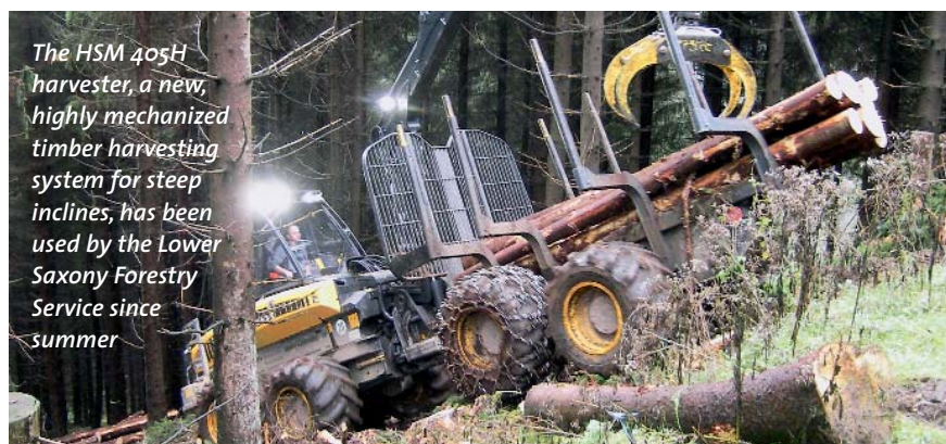
The HSM 405H harvester, a new, highly mechanized timber harvesting system for steep inclines, has been used by the Lower Saxony Forestry Service since summer

The main theme for LIGNA HANNOVER 2009 is “Making more out of Wood – Technology for Resource Efficiency”. Because for the forestry industry, getting more out of wood means using raw materials and technology efficiently. Wood utilization is a key part of this. Wood utilization – or “wood mobilization”, as it’s known in Europe – refers to the totality of organizational, advisory and logistical activities designed to maximize forest yields/ wood utilization within the constraints of sustainability. These activities range from blanket forest inventories, to reforestation, to forest crop manage-