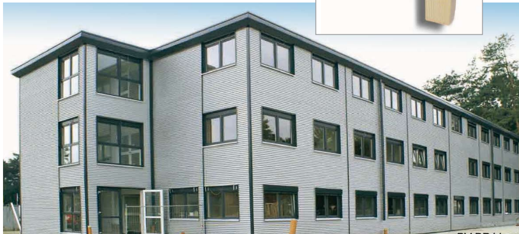
Modular construction company Karl Hoffmeister GmbH offers user-specified standard sizes.

for boutique car-maker Wiesmann AutoSport's new “transparent factory” in Dülmen. Cordes has also hinted at “another fascinating project” that it will be showcasing at LIGNA.