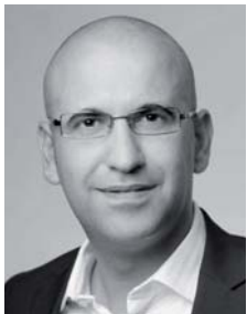
Mousse T. Music Producer & Artist mousse-t.com