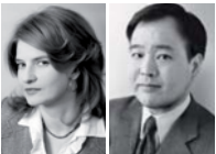
Natalya Kaspersky CEO InfoWatch, Chairperson of Board of Directors of Kaspersky Lab