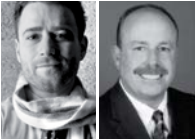
Stewart Butterfield Co-Founder, Flickr.com