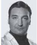
Mousse T., Producer & Artist, mousse-t.com

TALK - 11.30 a.m. – 12.00 noon, in German