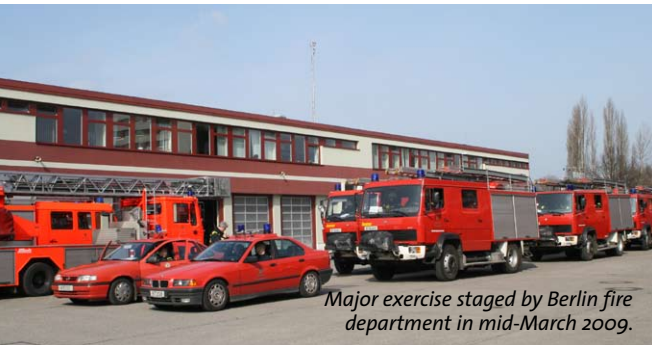
Major exercise staged by Berlin fire department in mid-March 2009.

Currently, fire brigades and emergency relief services across the globe are faced with a major realignment of their complex tasks. New technologies and operational methods, more efficient system integration, improved international cooperation – the advantages of all of these will be amply demonstrated at INTERSCHUTZ 2010.