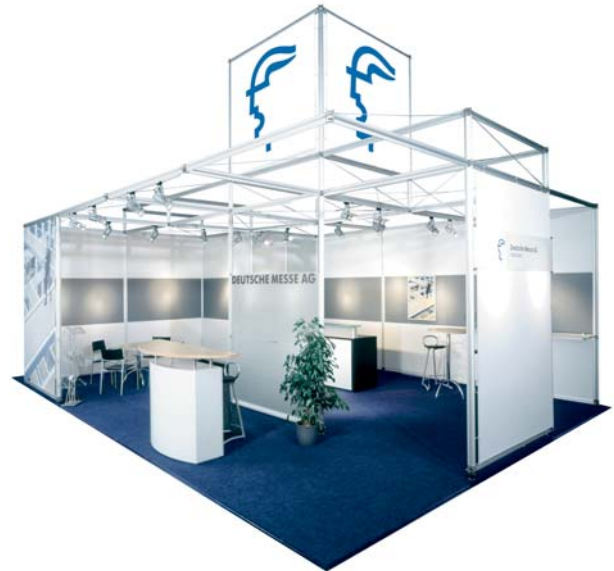
Typical stand configuration with additional fittings