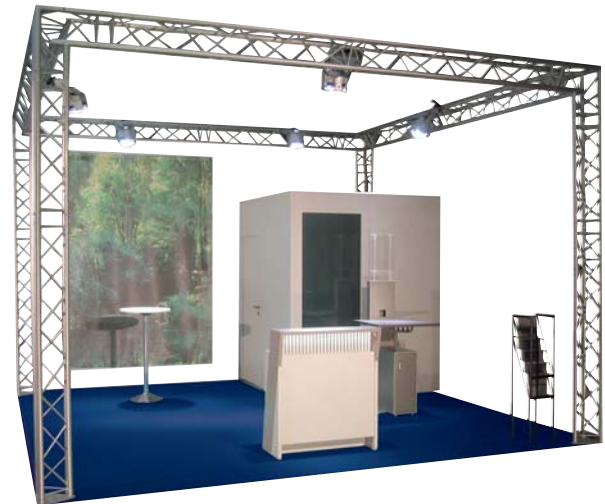
Typical stand configuration with additional fittings

For outdoor use, you can order a truss system (without any installations or additional fittings). Prices are available on request.