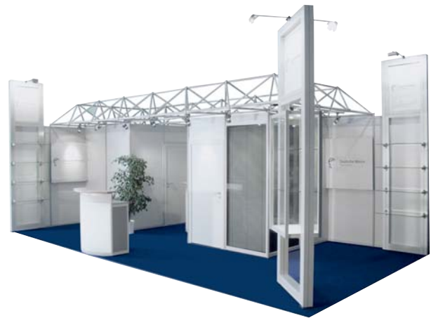
Typical stand configuration with additional fittings