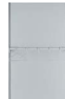
1.1 and 9.3