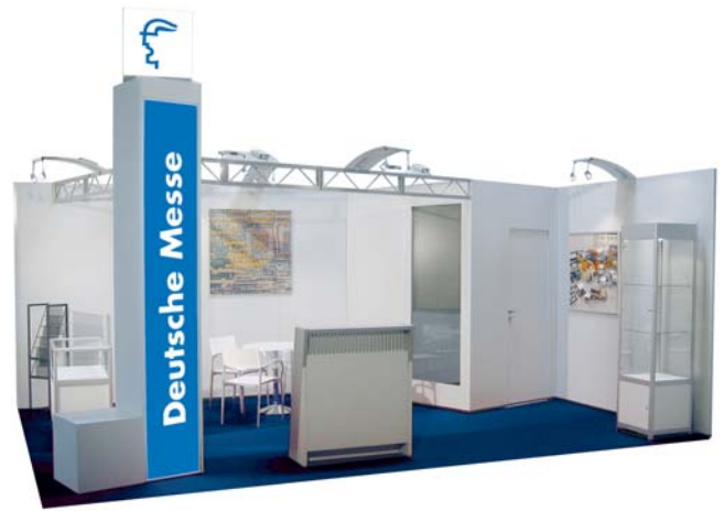
Typical stand configuration with additional fittings