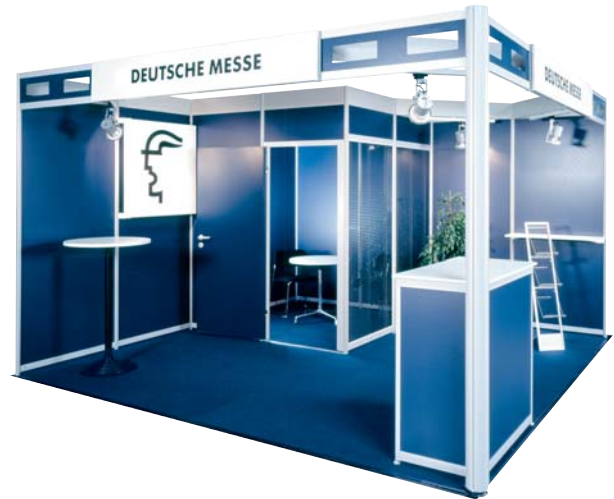
Typical stand configuration with additional fittings