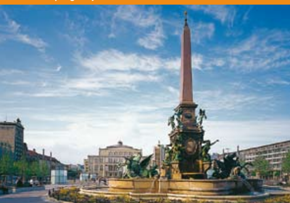
Leipzig city center will host a street fair

For further details, visit www.feuerwehrtag.de (German only)