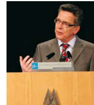
German Federal Minister for the Interior Thomas de Maizière delivers a welcome address to the CTIF conference