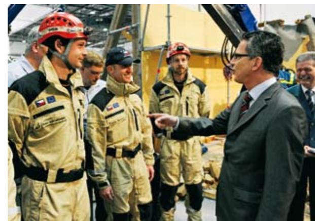
German interior minister Thomas de Maizière tours the showgrounds (right)