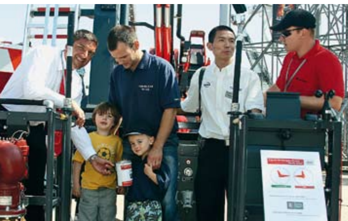
An uplifting experience for young and old

For many years to come, visitors and exhibitors alike will remember INTERSCHUTZ 2010 as an exciting time of spectacle, action and hi-tech wonder and a place where defining relationships were forged. The photos on these pages capture some of the highlights of this truly memorable tradeshow.