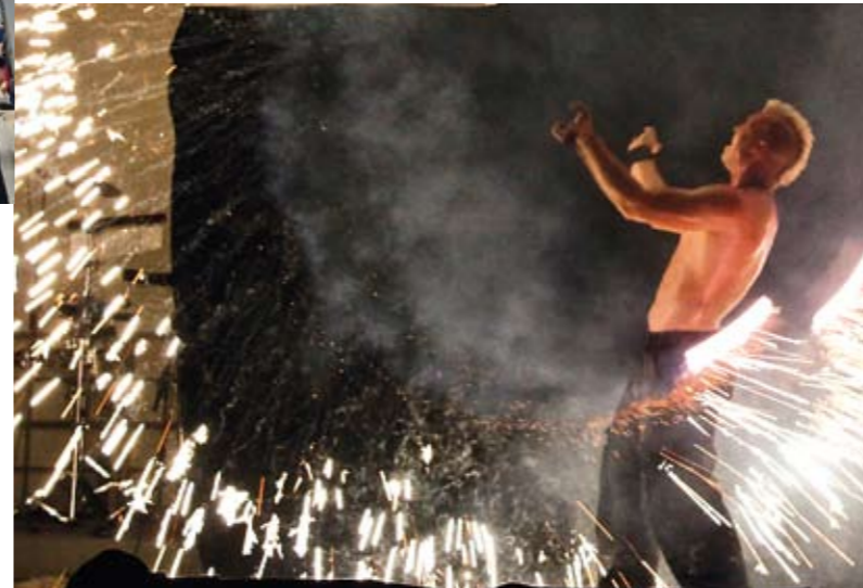
Deutsche Messe, Hannover, hosted an evening of fun, excitement and first-rate entertainment for exhibitors