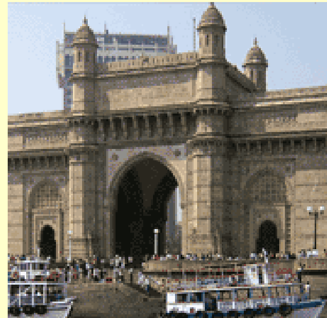
Gateway of India (Mumbai)

Website: www.hannovermesseworldwide.com www.mda-india.com www.cemat-india.com www.ia-india.com www.energy-india.org