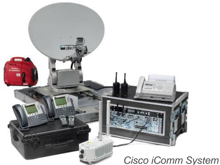
Cisco iComm System